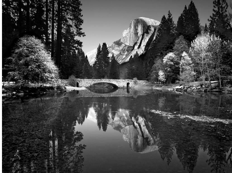
Figure 1: Example photo with high resolution. Caption created with “insert, reference, caption, figure” and the style changed to “thesis-figure caption.”