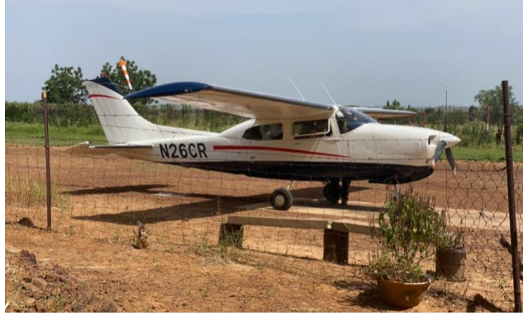
↑ I flew in this small plane, landing on the hospital's dirt landing strip

← There are small TVs like this scattered throughout the wards, usually 1 per room (which may have 8 to around 20 patient beds per area), which play the Jesus Film in the local language Hausa. Christian music videos also play and Bible stories sharing the Gospel on these TVs.