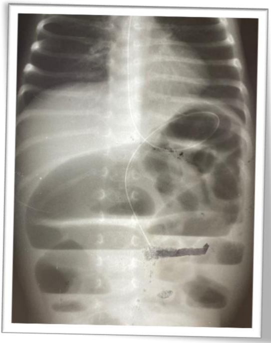
The dark oval shapes in the x-ray are intestines filled with air and you can see "air fluid levels" (flat bottom to the loops which suggests a bowel obstruction, with fluid pooled on the bottom of the loops of bowel in this upright abdominal x-ray).