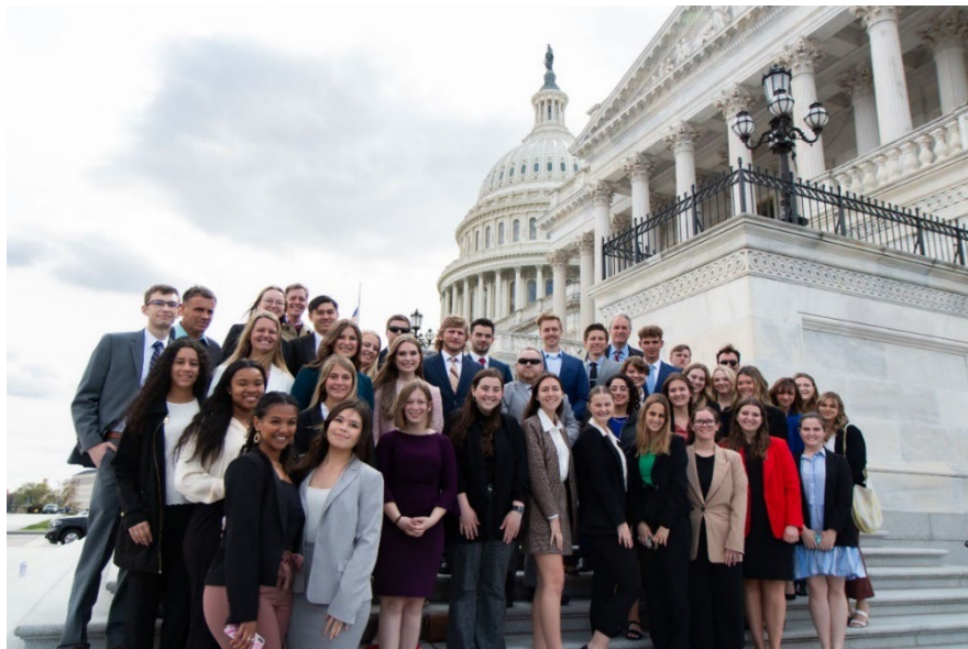
Students Outside the U.S. Capitol Building