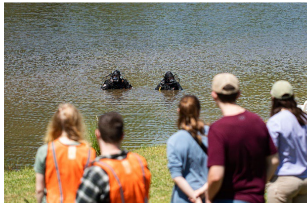
Students Observe a Water Recovery Exercise