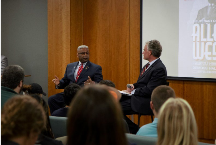
Lieutenant Colonel Allen West