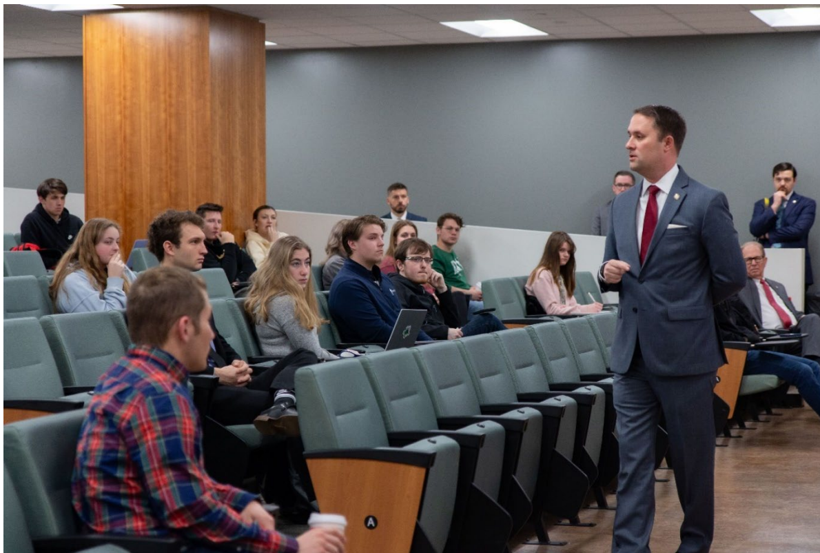
Attorney General Jason Miyares