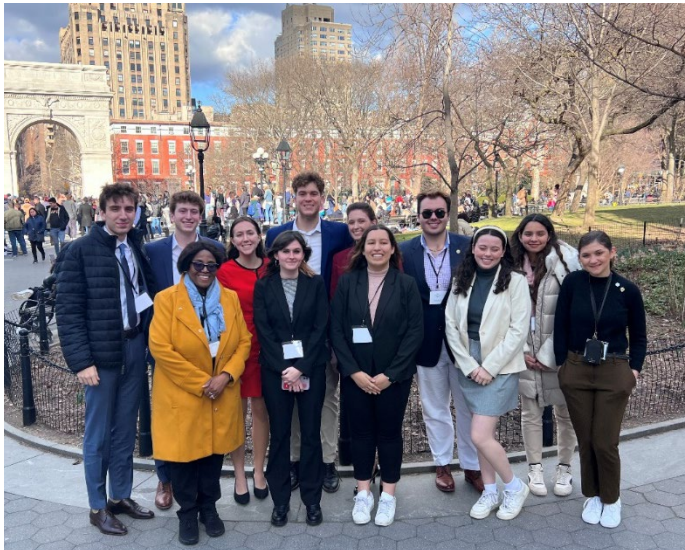
Liberty Model United Nations Team in Central Park

This was a unique opportunity to learn what intelligence is needed and how the intelligence process works to support decision-makers and troops on the ground. The most impressive part of the trip was the knowledge and professionalism of the US Army personnel they met. Thank you to the personnel at Fort Bragg for a great visit and service to our nation. Read more about the trip here .