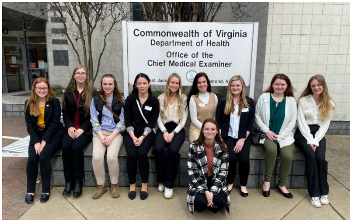
Helms Students Pose in Front of the Medical

office is responsible for reviewing suspicious, unusual, or unnatural deaths, and the Richmond lab has the largest "bone" lab in the state, which contains the skeletal remains of unidentified victims going back to the 1970s. Students toured the autopsy rooms, x-ray room, and epidemiology and medical examiner offices.