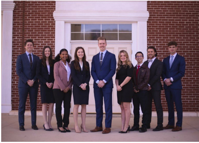
Mock Trial A Team