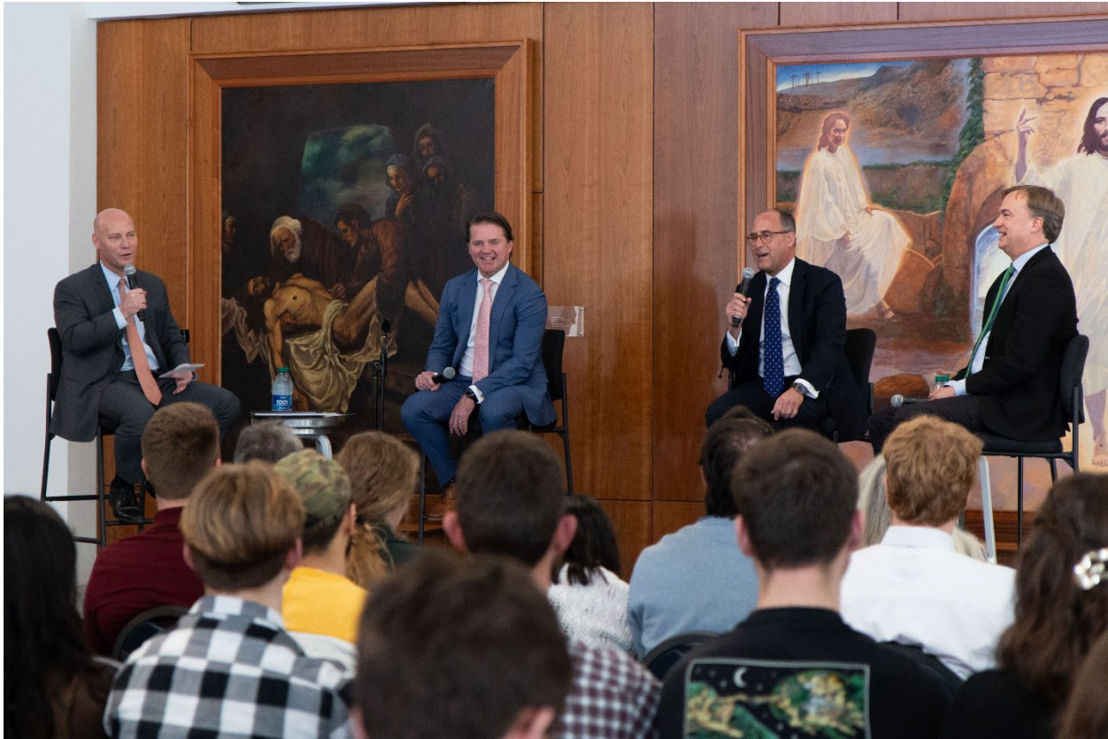
Marc Short, Brendan Stickles, Nick Snyder, and Mike Allen