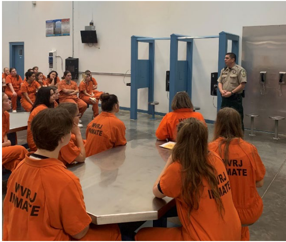
Helms Students hearing from Corrections Officer