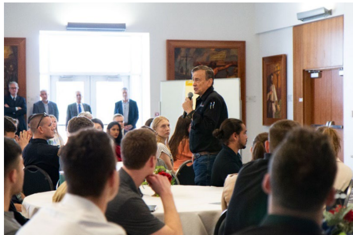
Lieutenant Colonel Dave Grossman