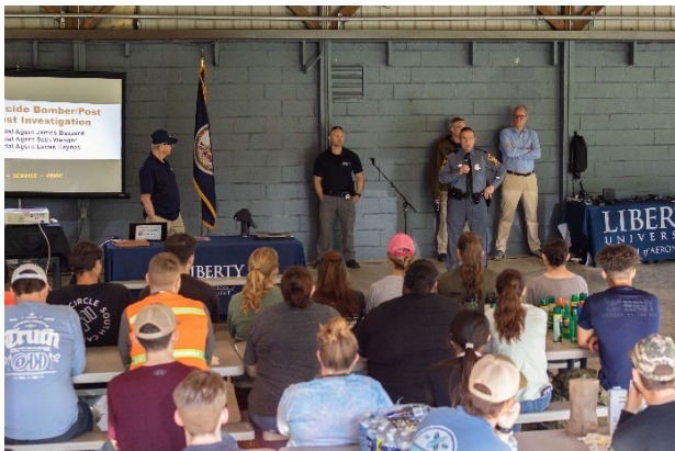
Virginia State Police Discussing Recruitment