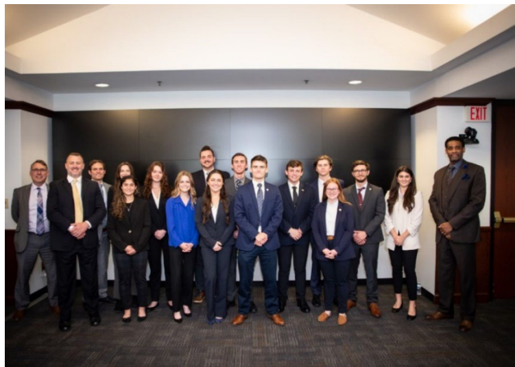
Richmond FBI Officials with LASI Team

Later that week, another team of Liberty University students provided a detailed analytical briefing to the Federal Bureau of Investigation at its Richmond Headquarters. Students from the Schools of Business, Behavioral Sciences, Communications and the Arts, Government, and Army ROTC constituted key team members who presented their findings to the Special Agent in Charge of the FBI’s Richmond field office. The topic addressed dealt with a sensitive federal law enforcement and national security challenge.