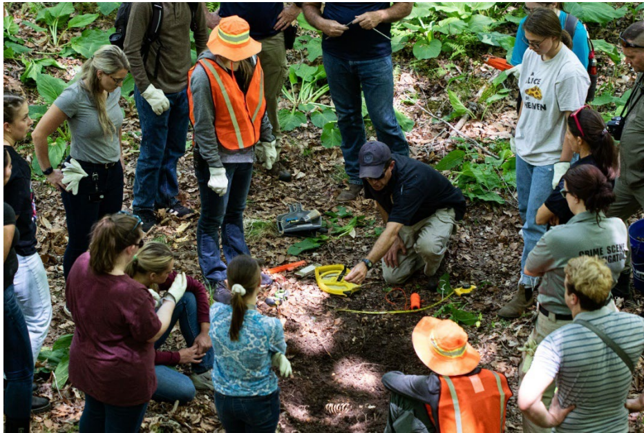
Students Participate in Pig on the Mountain with Virginia State Police