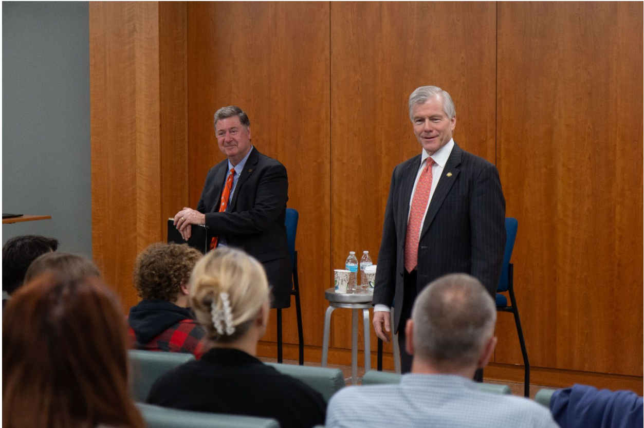
Governor George Allen and Governor Bob McDonnell

Former Governors of the Commonwealth of Virginia, Bob McDonnell and George Allen, came to visit our classes for College For A Weekend this semester! The Governors visited courses to lecture about relevant issues such as the national debt, inflation, and crime, and they also answered questions from students. We are grateful to have the Governors with us, and we look forward to their next visit. Read more about their visit here .