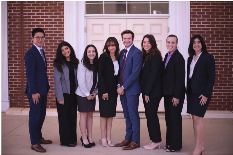
Mock Trial B Team