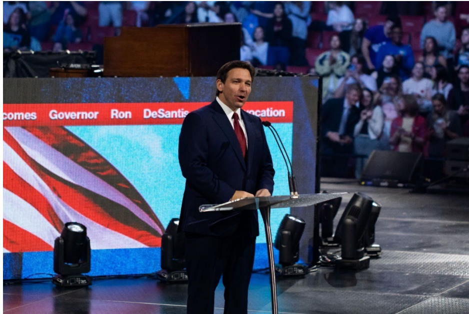
Florida Governor Ron DeSantis

In April, we hosted our Third Annual Spring Public Policy Conference, which featured Florida Governor Ron DeSantis and North Korean Defector and Human Rights Activist Yeonmi Park, as well as 7 plenary session panels, over 20 breakout sessions, and more than 50 paper presentations. It was a three-day conference, themed “Promise of the Declaration: Building on the Legacy of Life, Liberty, and Pursuit of Happiness”. Check out our program and articles from Liberty News , LU Champion , and our social media .