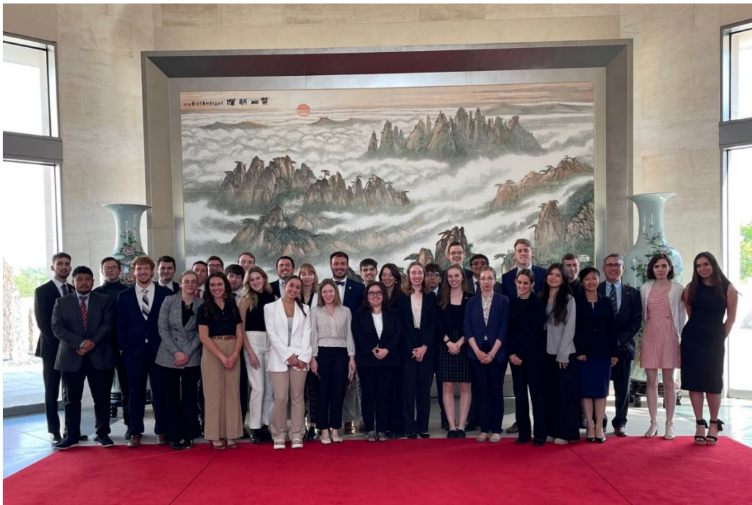
Helms Students Inside the Chinese Embassy

After departing the Chinese Embassy, students visited the Polish Embassy where they heard from Minister Counselor