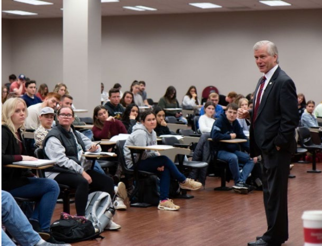
Governor Bob McDonnell

Former Governor of the Commonwealth of Virginia, Bob McDonnell, came to visit with our classes. Governor McDonnell is a great friend to the Helms School of Government, and we are always grateful for his willingness to invest in our students. He spoke about relevant issues such as the national debt, inflation, and elections. The Governor also answered a variety of questions from the audience and prospective students who visited Liberty for CFAW. We were grateful to have Governor McDonnell, and we look forward to his next visit! Read more about his visit here .