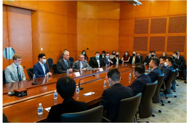
Students with Chinese Embassy Officials