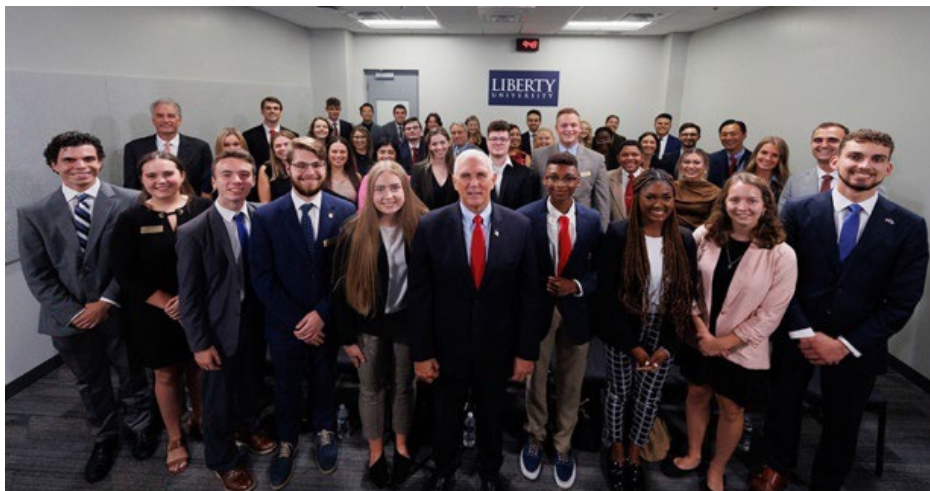
Vice President Mike Pence with HSOG Students

The Helms School of Government was delighted to welcome Vice President Mike Pence to Liberty University once again! Following Convocation, Vice President Pence met with some of our distinguished Helms students for an exclusive lecture and question & answer session. We are always honored to have Vice President Pence visit our campus and look forward to having him again in the future. Read more about his visit here .