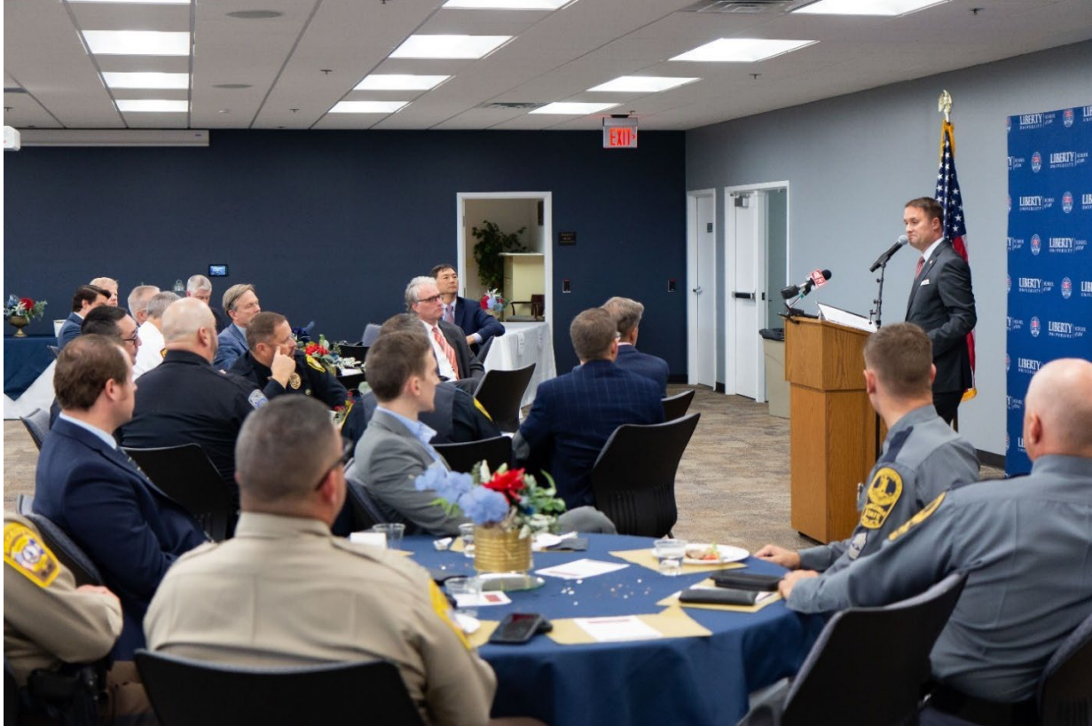
Attorney General Jason Miyares at the Law Enforcement

The Helms School of Government and the Liberty School of Law hosted their Second Annual Law Enforcement Appreciation Luncheon with local Sheriffs and Police Chiefs representing state and local agencies from Central and Southside Virginia. Virginia Attorney General Jason Miyares was the keynote speaker. We are grateful to all the brave men and women of law enforcement who put on the uniform every day to protect and serve. Read more about the Law Enforcement Lunch here .