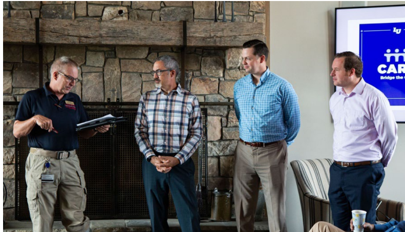
New Professors at the Faculty Retreat