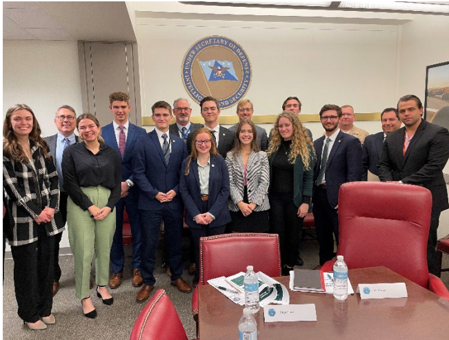
LASI Students at the Pentagon

A team of Helms School of Government students constituting the Liberty Analytical Support Initiative (LASI) visited the Pentagon to brief senior Department of Defense officials within the Office of the Under Secretary of Defense for Intelligence and Security. The topic for analysis this semester was selected by Pentagon officials and represents a critical national security challenge currently under consideration by the U.S. Government. Students from diverse fields of study directly engaged senior decision-makers with their ideas for how the U.S. national security architecture can effectively address the challenges facing our country. Read more about the Pentagon visit here .