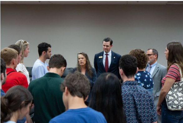
Faculty Meet with New Students at the Helms School Academic Welcome

The Helms School of Government was grateful for the opportunity for our new students and parents to meet our outstanding Helms faculty at our Academic Welcome at the beginning of the semester! We were encouraged by our students looking forward to their classes and to the exciting opportunities in store.