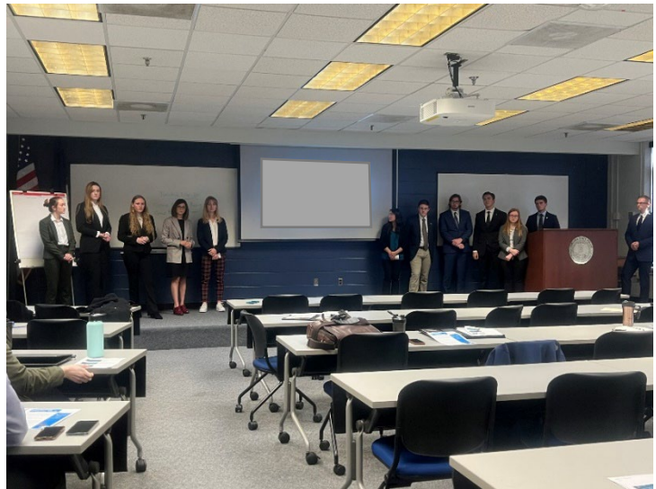
Students Present at Virginia Fusion Center