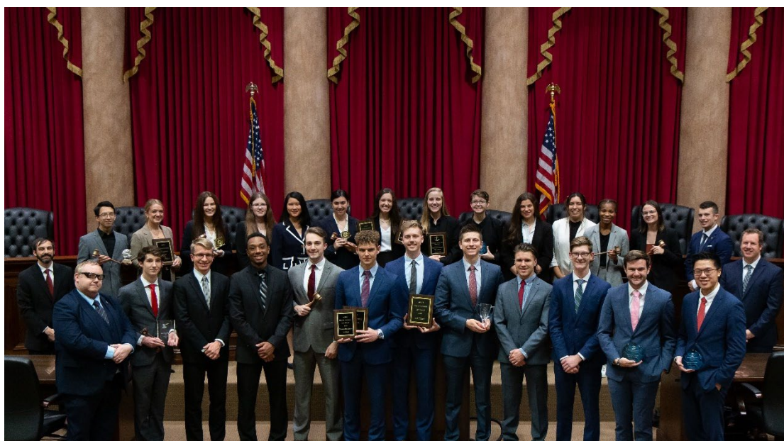
The 2022-2023 Moot Court Team