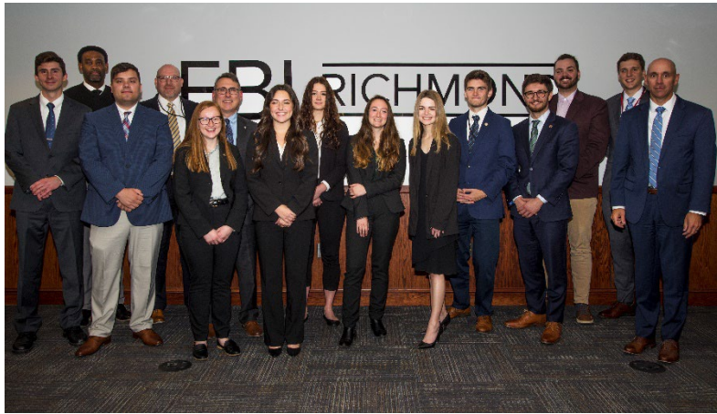
LASI Students at the FBI Richmond Center

forward to continuing our partnership with the FBI colleagues in the future! Read more out the LASI Richmond Visit here .