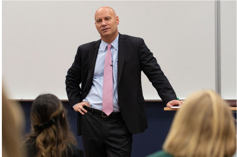
Chief of Staff Marc Short

The Helms School of Government had the pleasure of hosting Marc Short, former Chief of Staff to Vice President Mike Pence and former Legislative Director for President Donald Trump. Short visited various classes and taught on the politics and policy of tax reform. We hope you enjoyed his lectures and look forward to having him again soon!