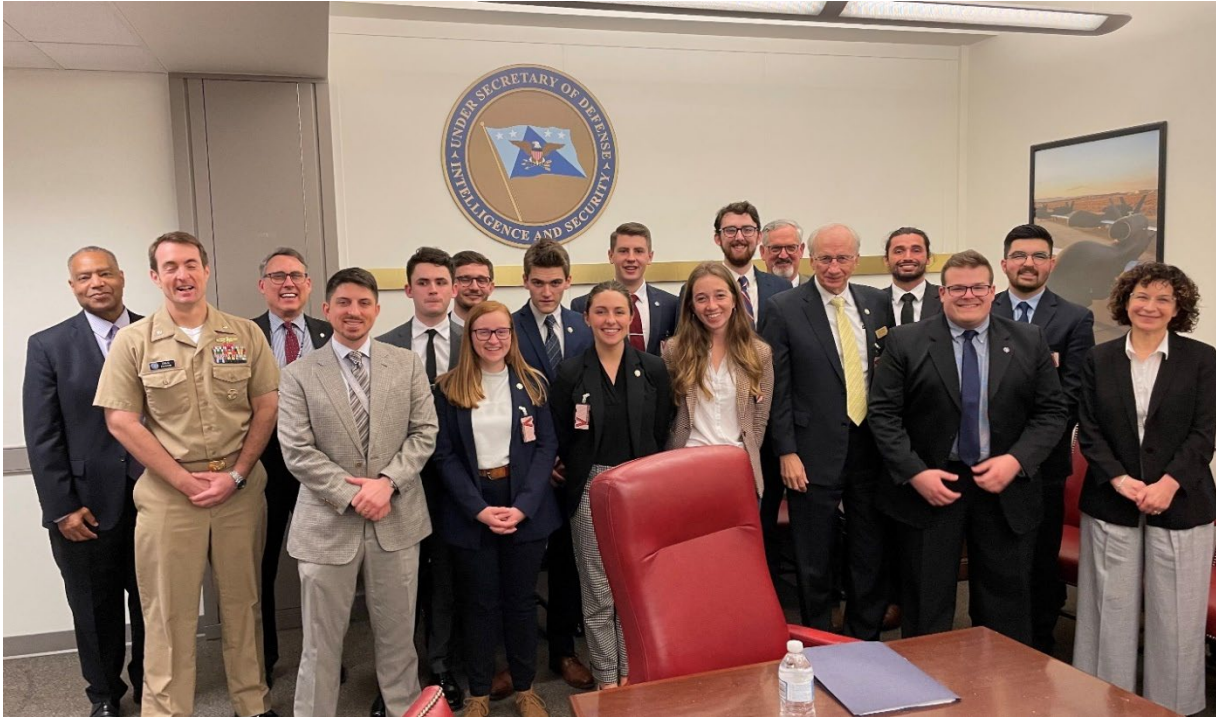
Students and Faculty meet with Senior Officials

The Liberty Analytic Support Initiative (LASI) team briefed key cybersecurity officials at the National Security Agency, as well as senior officials within the Office of the Undersecretary of Defense at the Pentagon. The student team shared a framework for conducting sentiment analysis for multimedia and discussed the national security implications of changing natural resource competition. Both the Pentagon and NSA participants emphasized the importance of the work done by the students and were eager to collaborate on the team's analytical findings. One senior Department of Defense official expressed his sincere appreciation for their complex analysis while noting its contribution to their deeper understanding of the problem set. He further voiced his confidence that these future national security professionals will be more than ready to take the baton from the current generation of leaders when the time comes.