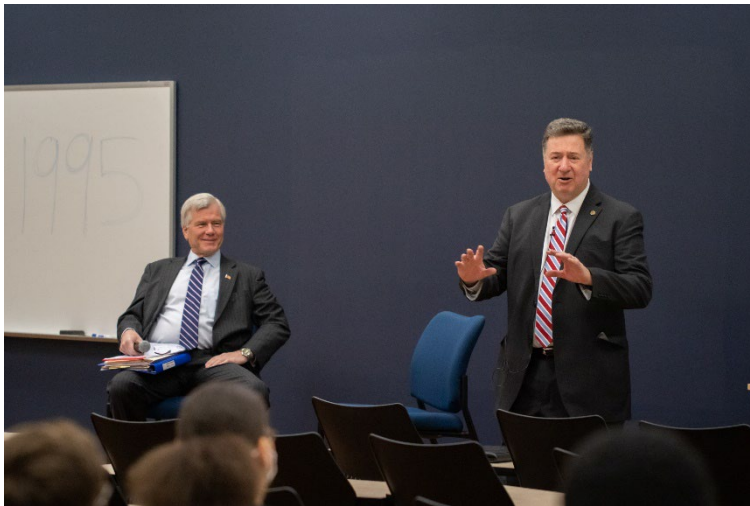
Governors Bob McDonnell (left) and Governor George Allen (right)

In addition, Former Virginia Governors George Allen and Governor Bob McDonnell visited the Helms School of Government for the Spring Public Policy Conference. The Governors participated in a legislative panel and spoke in various classes regarding politics and policy.