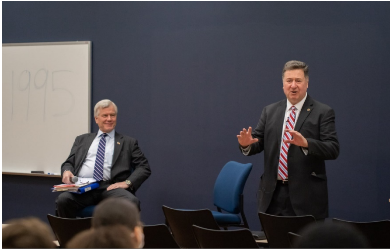
Former Governor McDonnell & Governor George Allen

We were delighted to welcome to the Helms School former Virginia Governor George Allen and former Virginia Governor Bob McDonnell! The former governors spoke to government students in our Constitutional Government and American Constitutional Law courses. They also were hosted by the School of Law as a part of its Professionalism Lecture Series.