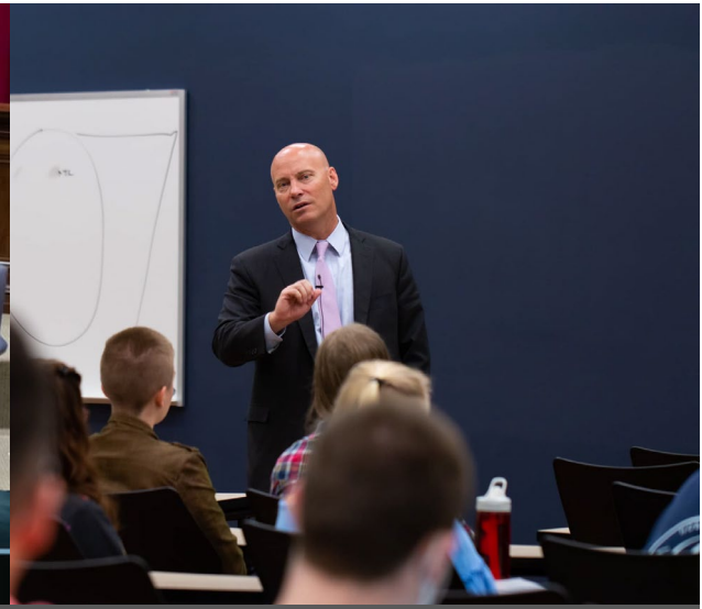
Former Chief of Staff Marc Short