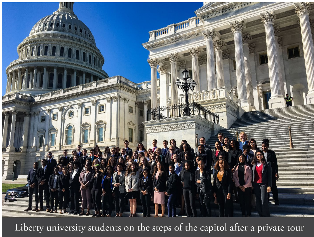
Liberty university students on the steps of the capitol after a private tour