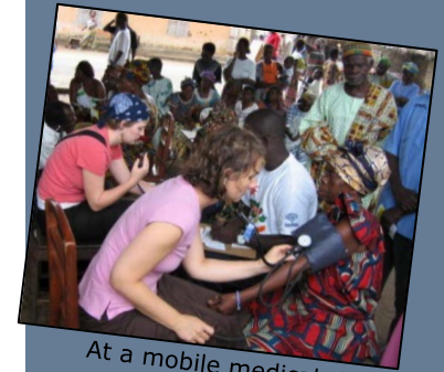
At a mobile medical clinic taking blood pressure