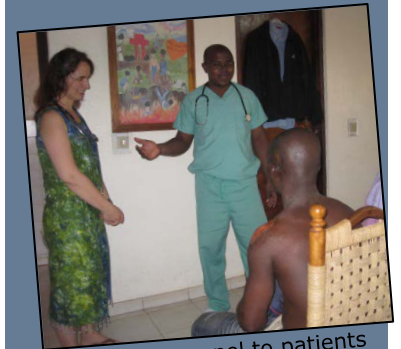
Sharing the gospel to patients at the hospital in Togo