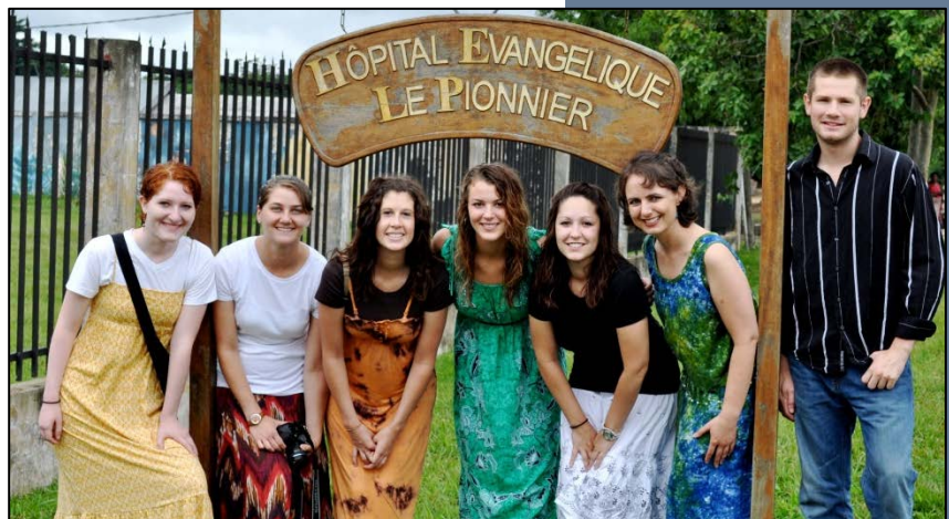
Medical Mission Team to Congo