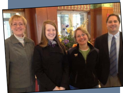
CTE Staff at VA Tech Conference