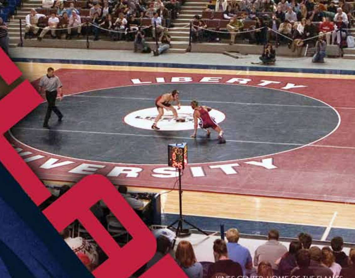
VINES CENTER, HOME OF THE FLAMES