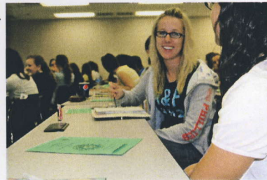
Pre-informational meeting 2009

In the forthcoming issues, this space will give an update about past events and tell the world how much fun Pi Sigma is having! The rest of the newsletter will be filled with helpful websites, LU reminders, and some insight about the world of education. We hope that YOU become a faithful reader of Slice of Pi